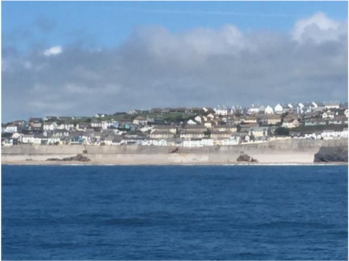
Where: Portleven Looking: NW