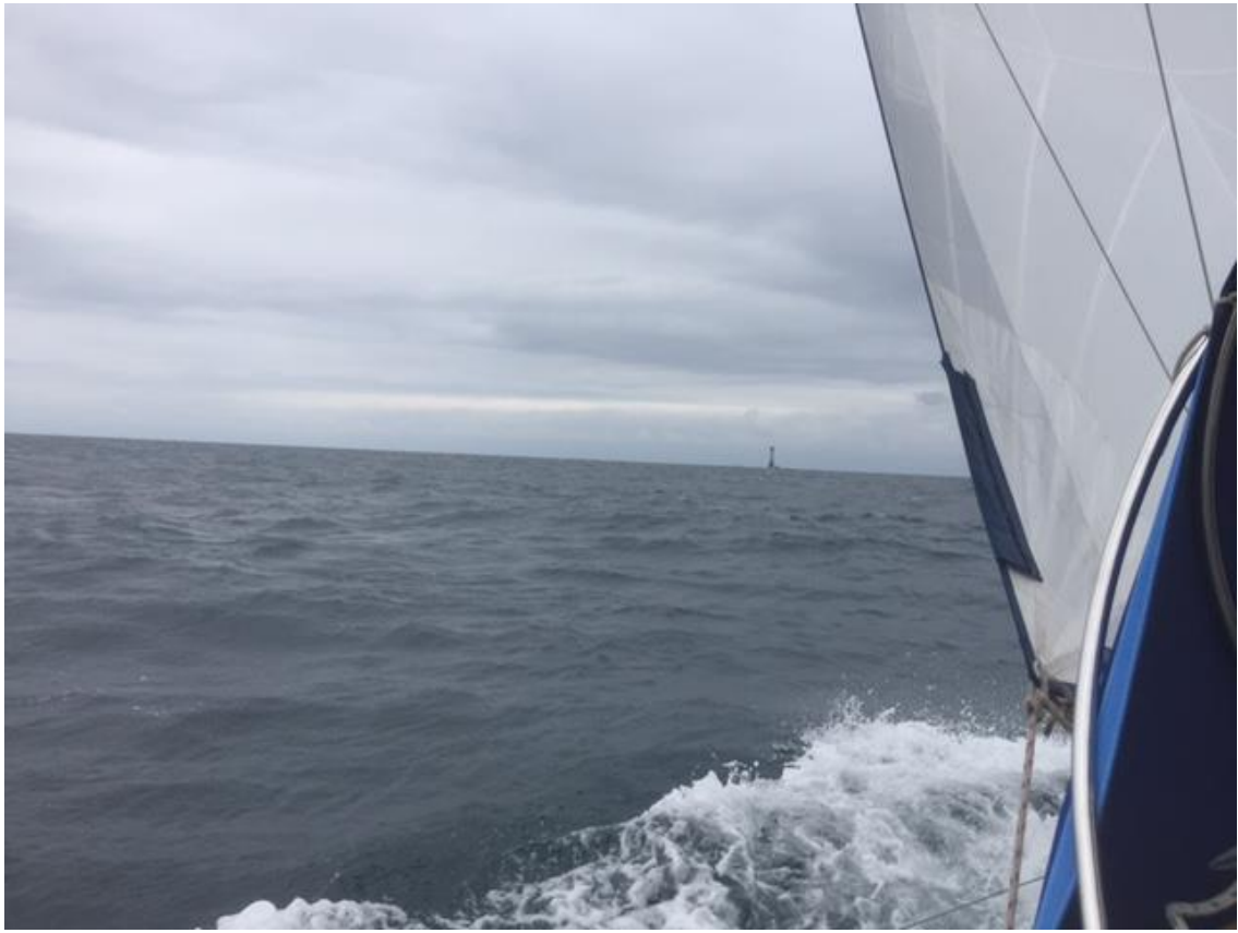
Where: Wolf Rock Lighthouse Looking: SW