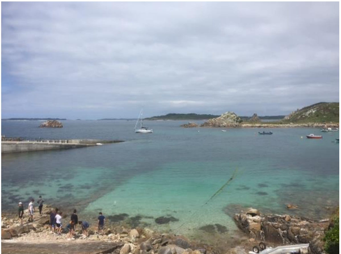
Where: St Agnes Harbour Looking: E