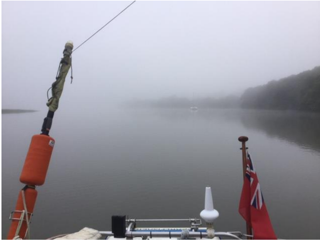
Where: Pentilly Looking: ??