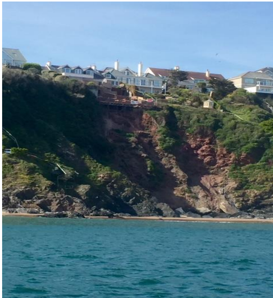
Where: Sharp Land Point River Avon Looking: N