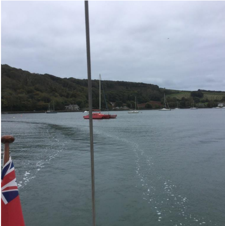
Where: Millbrook Lake Looking: SW