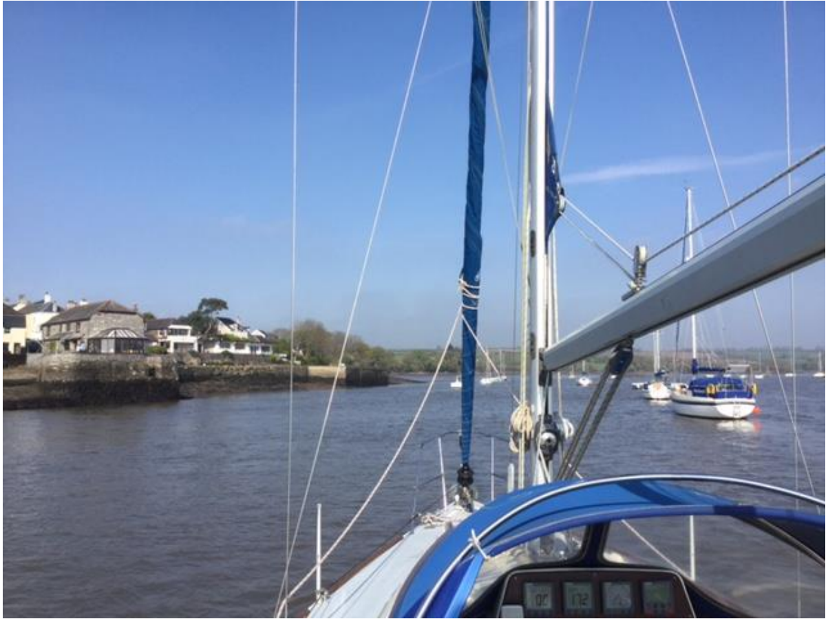
Where: Cargreen Looking: NW