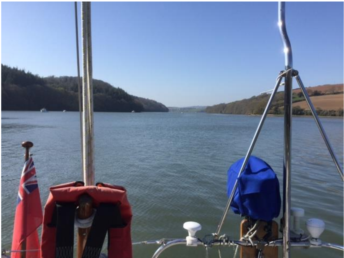
Where: Dandy Hole Looking: E