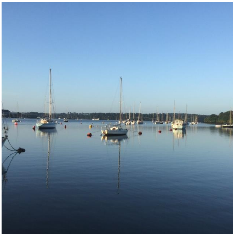
Where: Saltash Pontoon Looking: S